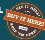
EXHIBIT HALL PREMIERE 5 PM - 8 PM