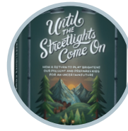
Book Signing 10:10 AM - 10:40 AM Exhibit Hall Ginny Yurich