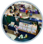
Exhibit Hall Hours 9:30 AM - 8 PM Exhibit Hall A