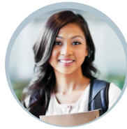
College & Career Fair 9 AM - NOON Main Hallway