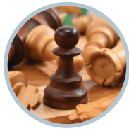
Chess Championship 9:30 AM - 12:30 PM Exhibit Hall (extra charge applies)