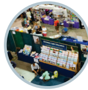
Exhibit Hall Hours 9:30 AM - 5 PM Exhibit Hall A