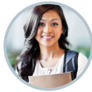
College & Career Fair 9 AM – 1 PM MAIN HALLWAY