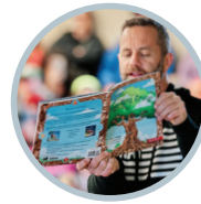
Story Hour Book Reading 10:45 AM – 11:30 AM B-21 A/B/C