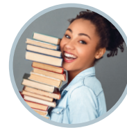
UCS Book Gleaning Starts at 4:30 PM Exhibit Hall C