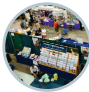
Exhibit Hall Hours 9:30 AM – 5 PM Exhibit Hall A