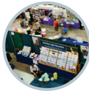
Exhibit Hall Hours 9:30 AM – 8 PM Exhibit Hall A