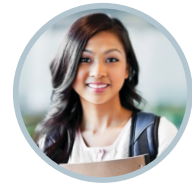
College & Career Fair 1 PM – 5 PM Main Hallway