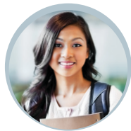
College & Career Fair 9 AM – NOON Main Hallway