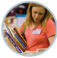
Used Curriculum Sale 9 AM – 7 PM Exhibit Hall C