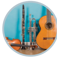
Instrument Petting Zoo —All Day— Exhibit Hall A